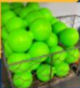
DOUBLE LACROSSE BALLS!