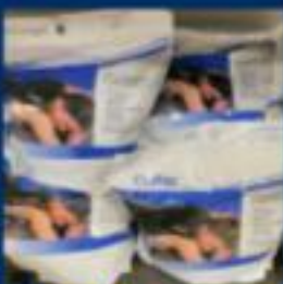
LARGE ICE PACKS!