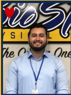
Yaudi Flores Institute of Technology